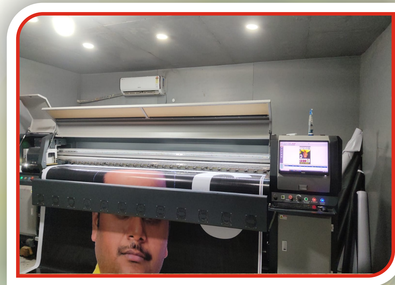
Konica 512i Solvent Printer