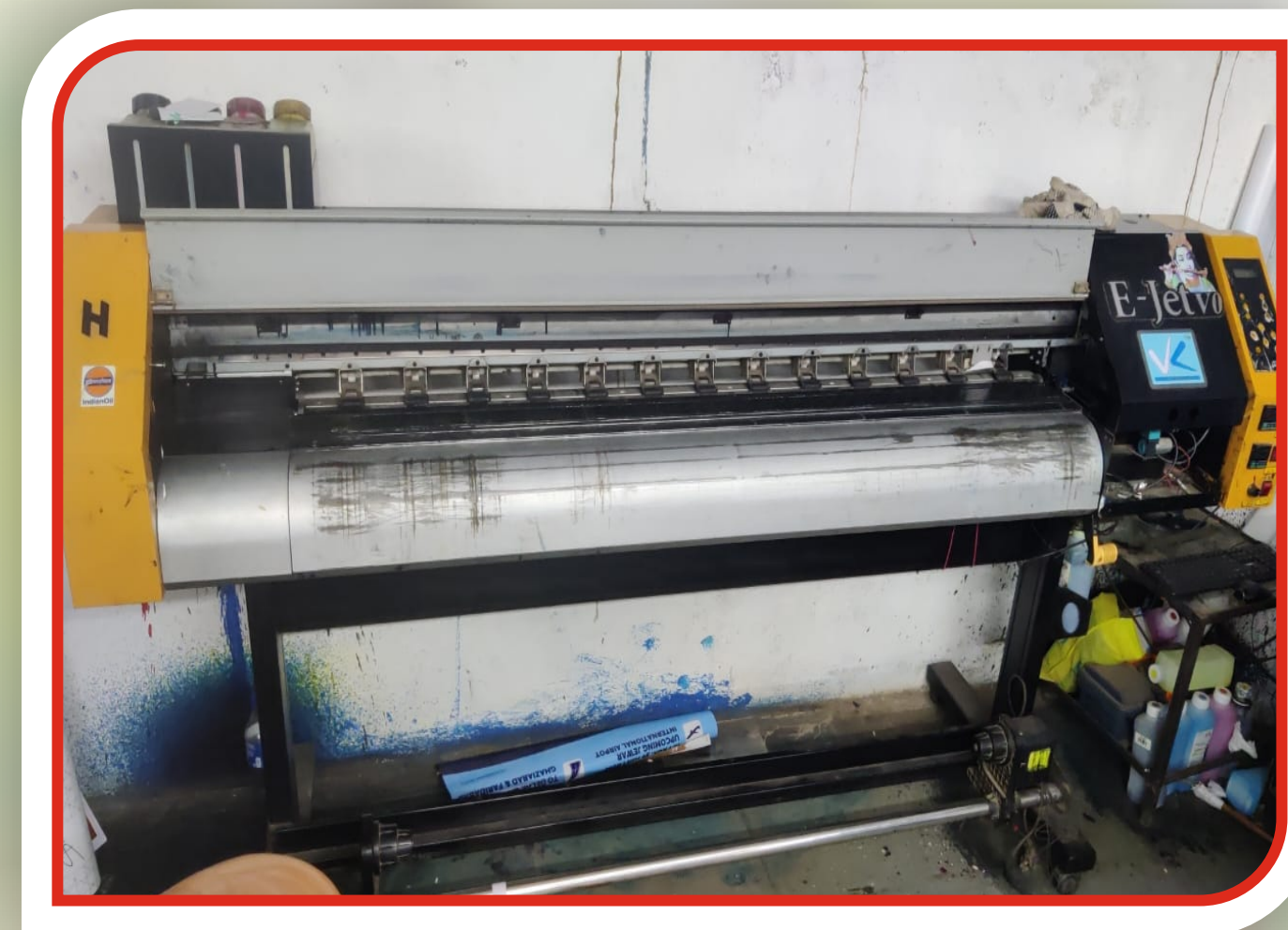
Eco Solvent dx5 Head Printer