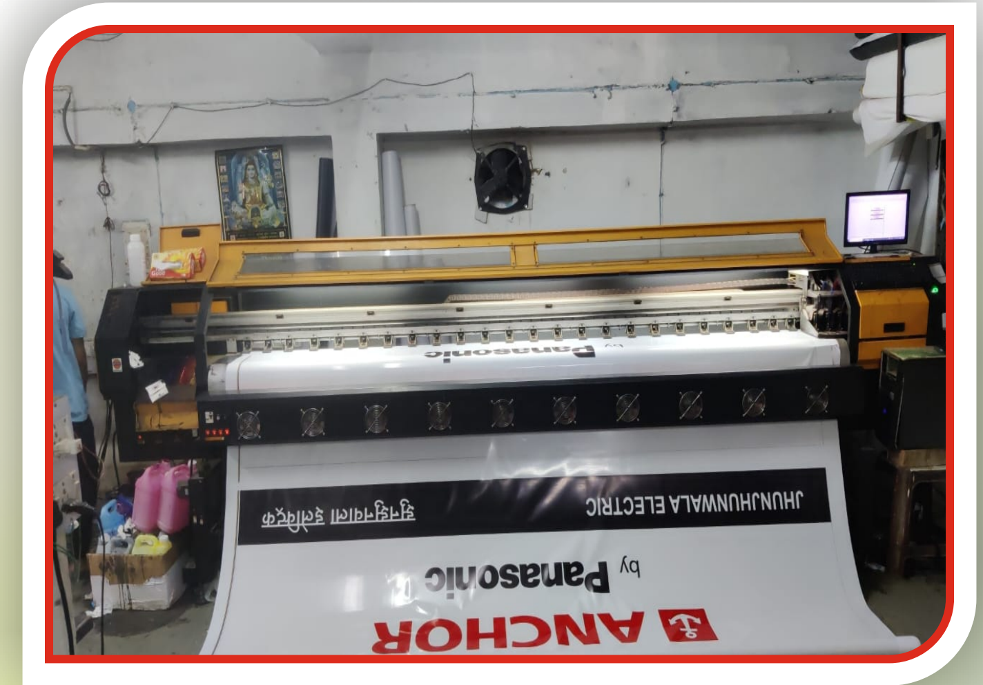
Konica 512i Solvent Printer