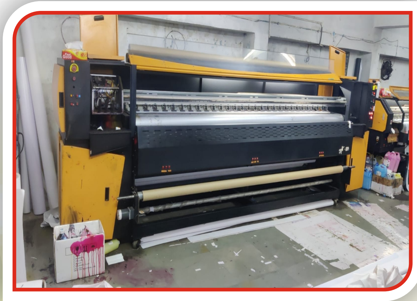
Konica 512i Solvent Printer