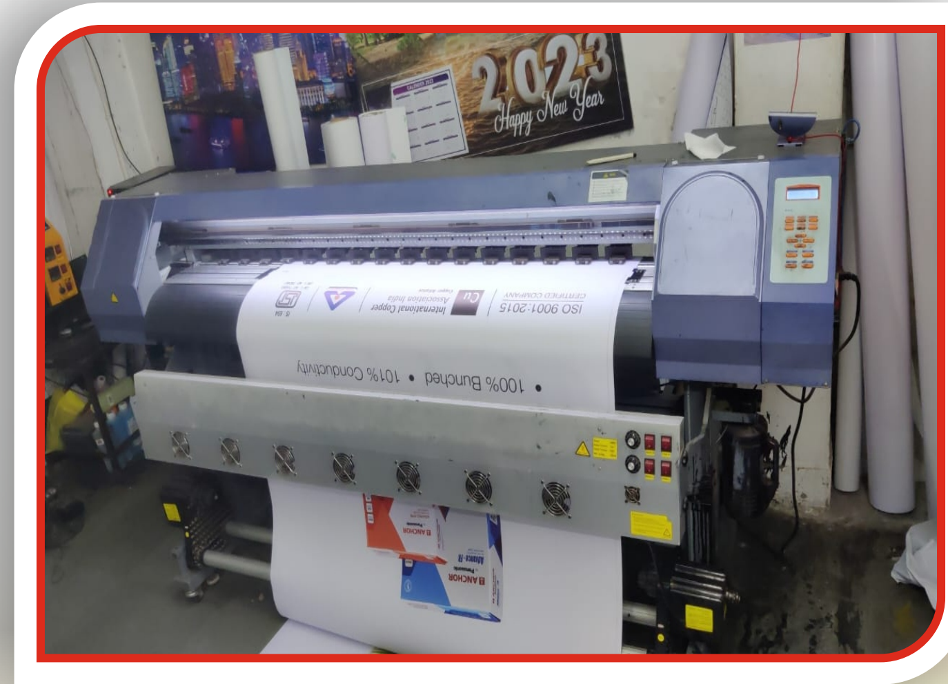
Eco Solvent dx5 Head Printer